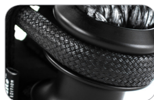
Full covered Black Dyneema loop