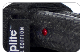
Microchip implant - MMS